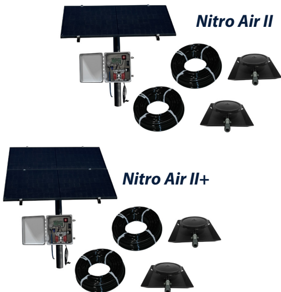
Nitro Air II